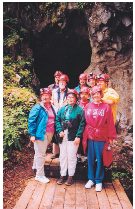
El Capitan Cavers

Our steelhead season begins with a trip for anglers who desire (or insist on) absolute adventure. Entirely exploratory, this expedition will highlight a first hand look at some of North America's last, unspoiled, wild steelhead systems. We'll explore and fish several remote estuaries and bays along the outer reaches of the South Prince of Wales Island Wilderness, a cluster of islands just north of the