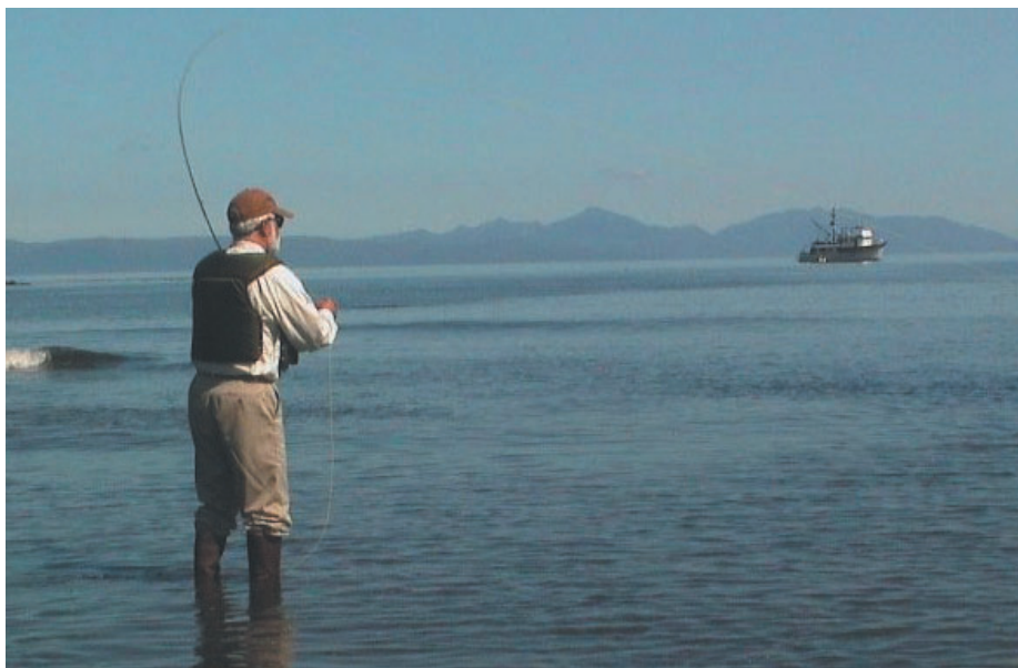
Salmon flyfishing afternoon

Following our exploratory adventure we'll continue to sample Southeast Alaska's spring steelhead runs as we sail northward, stopping to fish estuary systems and nameless bays for mint bright steelhead along the way. Steelhead in our local waters run 8 to 16 pounds with an average of 12-pound. Generally speaking, most of our steelhead fishing closely resembles New Zealand's trophy trout fishing, where watersheds flow gin clear from steep rain forest canyons laced with tumbled down trees. There's walking and stalking involved and sight casting to personal pods or solitary fish are more the rule than the exception. These trips offer fly rodders some of the best opportunities in North America to intercept these magnificent and