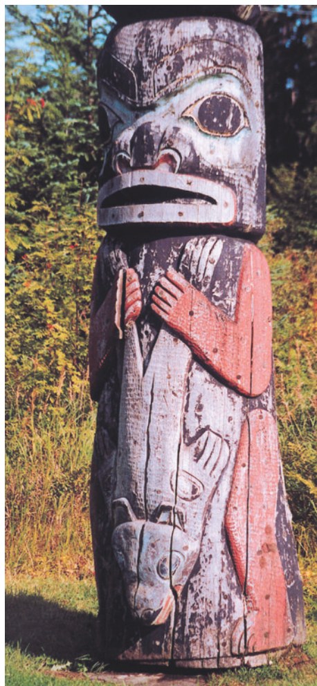
Kake Totem