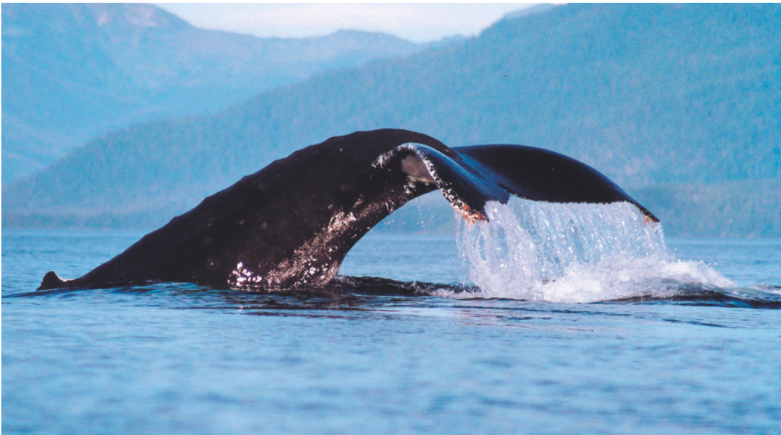
Dripping jewels