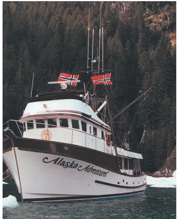
M/V Alaska Adventurer

Once again Alaska Sea Adventures is proud to offer a super selection of exciting guided expeditions with some of the best guides available. We are very fortunate to have access to a host of professional guides in a large variety of activities and interests, enabling us to create a customized