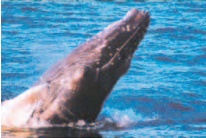
Spy hopping humpback

Adventure's schedule of events and early planning. We hope this may help you obtain a front row seat to a real Alaskan adventure presented with precious local knowledge in one of the earth's most beautiful natural arenas. We specialize in creating custom cruises based on each particular group's interest. Bring us your ideas and let's sit down in the chart room and plan a voyage like no other. As always, Alaska Sea Adventures has the regional advantage of being a true locally owned and operated company and we're very proud to share 'our' Alaska with you!