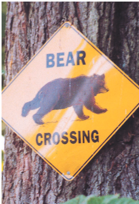
Alaska traffic sign

our observations and adventures. We all walked away with great memories and new friends. From the perspective of a naturalist/guide, the trip couldn't have been much better