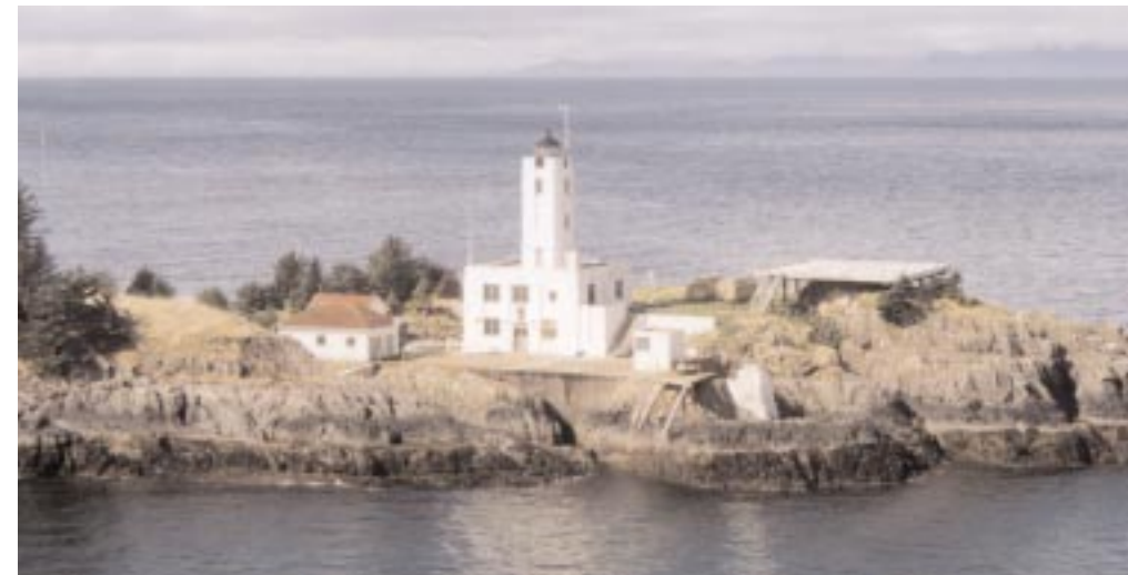
Five Finger Light House