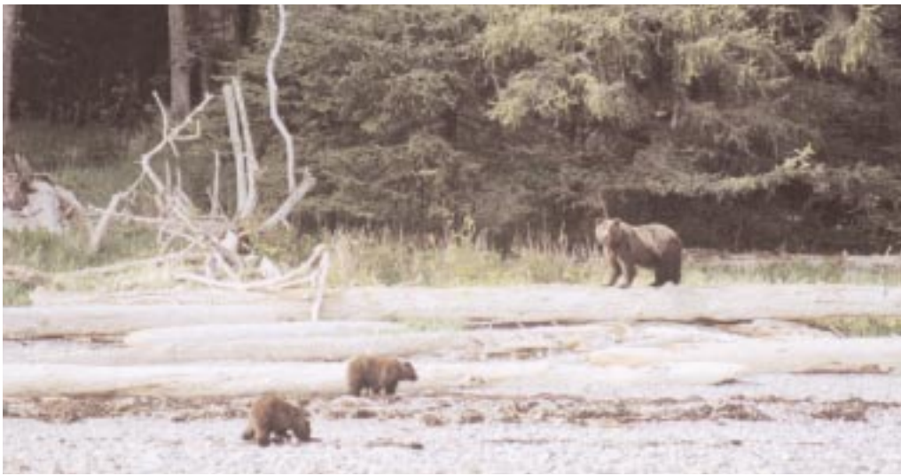
Grizzly bear sow and cubs

and great wildlife viewing. Some of our September excursions still have space available, which will be offered at a fall discounted price for those who can appreciate the wonderful potential for an Inside Passage cruise at this time of year.