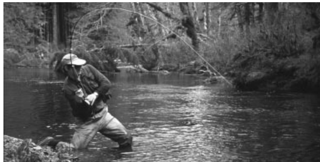
Fighting for that salmon

Join us this fall for a week-long adventure chasing silver salmon. You won't believe the silver salmon action!! All you need to do is bring your imagination, and we'll create a special custom expedition with a variety of region-wide options that can include paddling on ocean going kayaks, peeking in on the bear as they feed on spawning salmon, hiking through uninhabited bays & forests and whale watching.