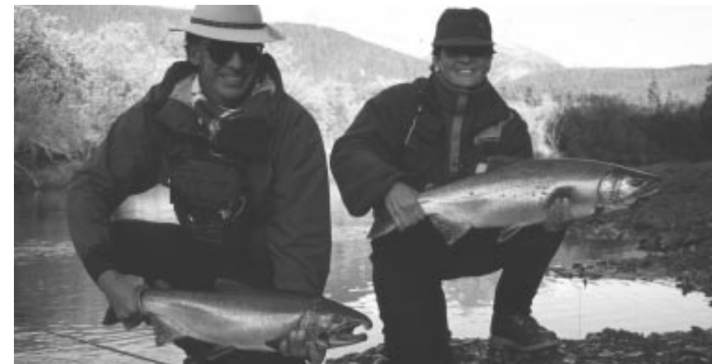
Silver (Coho) salmon

Alaska Adventurer's 2nd annual Coronation Island Natural History Expedition . This trip calls out to a special breed of person...those with a bit of the Indiana Jones spirit within, and includes visiting the world class El Capitan cave of Prince of Wales Island. It's an adventure to a rarely visited coastal region island filled with magnificent beauty. The fact that it's almost completely free from other visitors makes it just that much more exciting and special. Local naturalist & guide Jack Eddy will once again delight us with his keen knowledge of the flora, fauna and history along our route and destination. The 2002 Coronation Island expedition will surely be one of the highlights of the summer, and space will probably fill quickly.